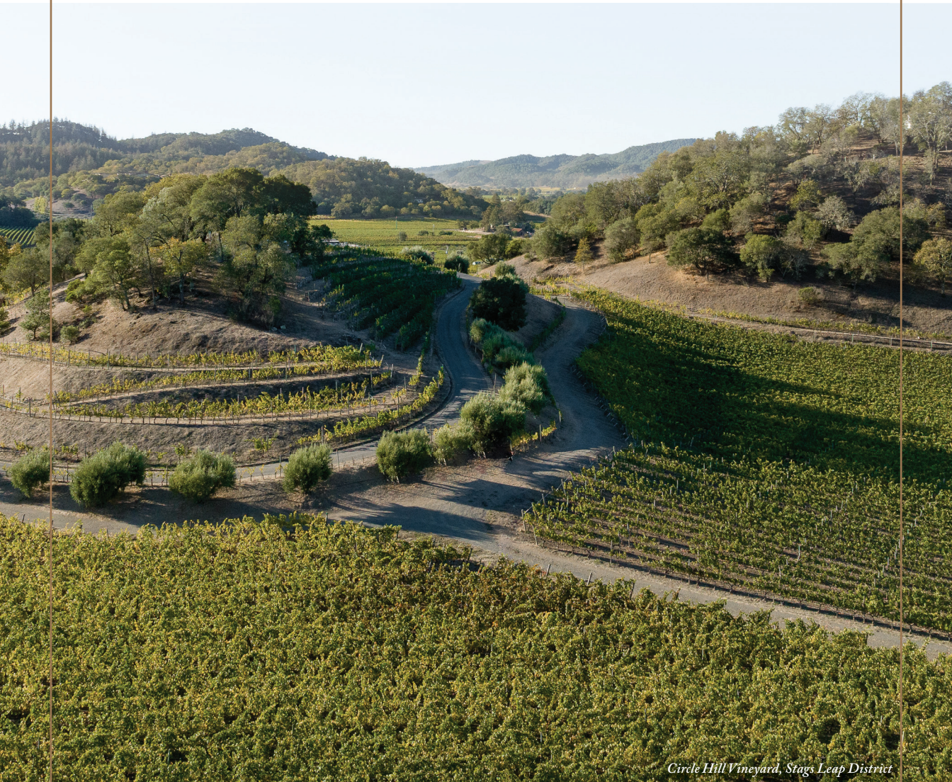
Circle Hill Vineyard, Stags Leap District